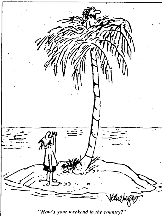
"How's your weekend in the country?"